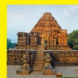
Konark sun temple